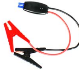
Smart jump starter