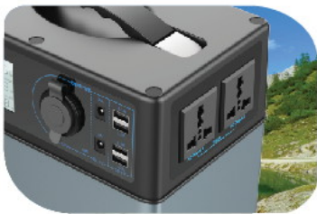
Pure sine wave inverter – supports up to 300W

The POWERplus Wallaby is your ideal companion for power needs in emergencies, camping, outdoor, boating etc. This product has an integrated pure sine wave inverter; which can provide the most stable AC voltage to power your AC electrical appliance up to 200W.