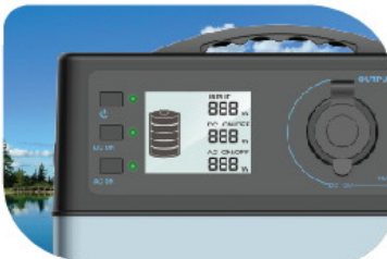
LCD display with backlight function