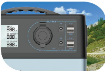
DC 12V and 5V USB output ports