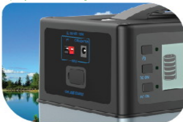
Charging in ports and jumpstarter port