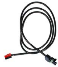
Solar charging cable